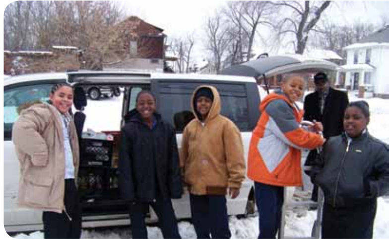
JOOI gets in the game! Members get ready to hand off tons of canned goods to a local food pantry.

During this year's Souper Bowl of Caring, JOOI Members at Loving Elementary School in Detroit, Michigan, went far beyond the typical game plan to help those in need during the weeks leading up to the Super Bowl.