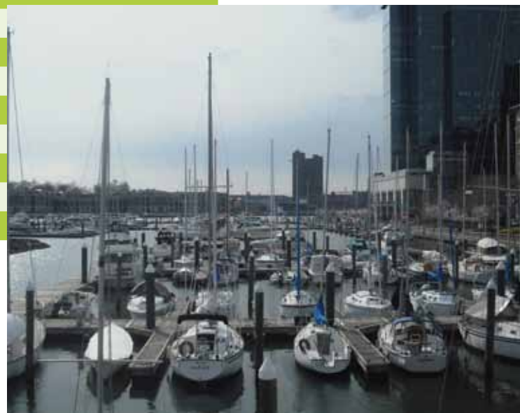
Just by taking a water taxi, you can see all of the sights in this newsletter and much, much more!