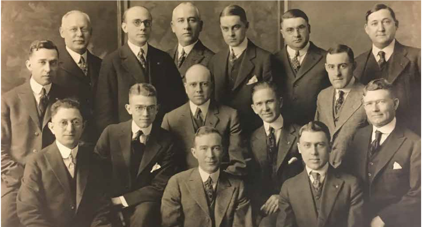
The original members of the 1916 Optimist Club of Indianapolis, Indiana

The Optimist International Organization was founded at a convention in Louisville, Kentucky, in 1919, uniting various local and regional clubs, the first of which was founded in Buffalo, New York in 1911. At the convention, the first official charter of the international organization was awarded to the club in Downtown Indianapolis, Indiana which was founded in 1916.